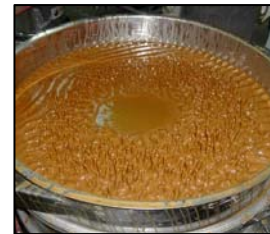
Fruits concentrated juice