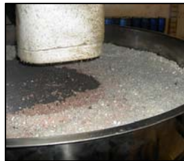
Paper and plastic recycled