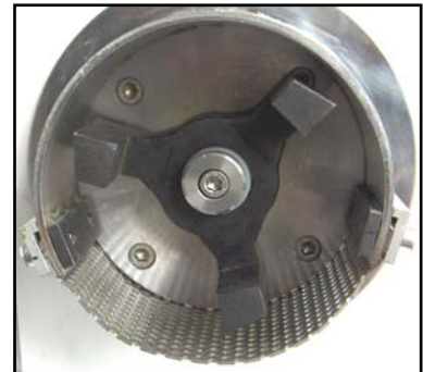
Grinding mill with interchangeable filter.