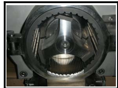
Hammer mill with sieves and knives changeables.